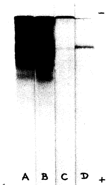
Fig.1. Polyacrylamide gel electrophoresis of (A) V. graminea extract (10 \mu l) (B) inactive fraction from affinity chromatography (15 \mu l) (C) lectin after affinity chromatography (70 \mu l) (D) lectin after gel filtration (140 \mu l). Gels were stained with Coomassie Brilliant Blue.

tion of protein in the solution of purified lectin is of the range 100 \mu g/ml, taking into account the coefficients of absorbance at 280 nm for other lectins [21]. The agglutinating titer of this solution is 1:128, the agglutination is specific for N erythrocytes. The results obtained are comparable with those of Prigent and Bourrillon [17], regarding the purification factor, the electrophoretic mobility, and the specific agglutinating activity of the purified lectin.